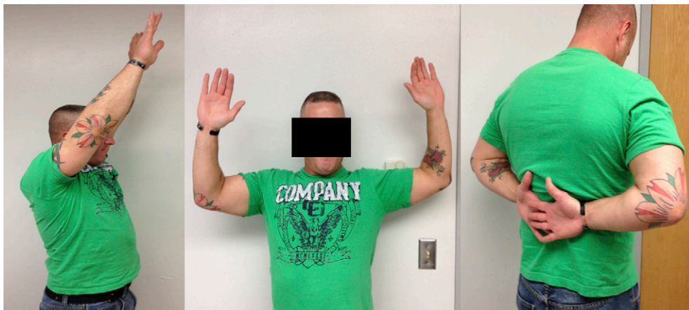
FIGURE 3. Clinical range of motion evaluation postoperatively.

Successful RCR depends on proper diagnosis and treatment based on tear configuration, tendon integrity, fatty infiltration, patient age, and medical comorbidities. 2 Failure of RCRs results from diagnostic errors, technical error, inadequate biologic remodeling, and/or traumatic failure. 7 In the current case, the rotator cuff tissue failure may be attributable to poor tissue quality and patient noncompliance. In cases of failed RCR, tissue is often massively retracted and scarred, requiring extensive tendon mobilization to achieve anatomic repair, although this is sometimes not possible. In similar circumstances, poor tissue quality or partial repair can benefit from orthobiological augmentation, particularly using biologic scaffolds. Orthobiological augmentation ensures footprint coverage in areas of poor tissue quality or incomplete